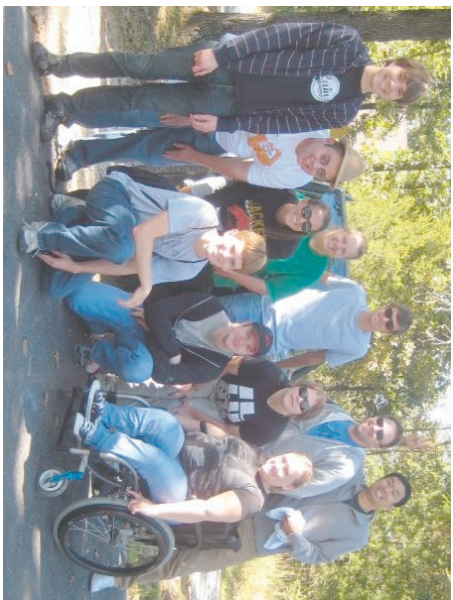
Some of our students at fall retreat this year at Maramatha Christian Camp in Southern Missouri.

Am I cut out for campus ministry? No, I'm not. But one huge lesson I've learned over the past few months is that it doesn't really matter if I was "cut out" for it. God said to Moses, "Who gave man his mouth? Who makes him deaf or mute? Who gives him sight or makes him blind? Is it not I, the Lord?" (Exo. 4:11). I'm no where near qualified for campus ministry, but thanks to our faithful Father, I don't really have to be. God has been teaching me so much in my time as an intern with Campus Christians to this point. It's hard to imagine what else he could have in store for me to experience in the following months!